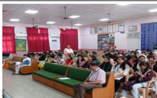
Students' participation and interaction

Kandhya Principal SMRK-BK-AK Mahila Mahavidyalaya, Nashik - 422 005.