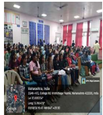
Students' participation in the program

Kandhya Principal SMRK-BK-AK Mahila Mahavidyalaya, Nasik - 422 005.