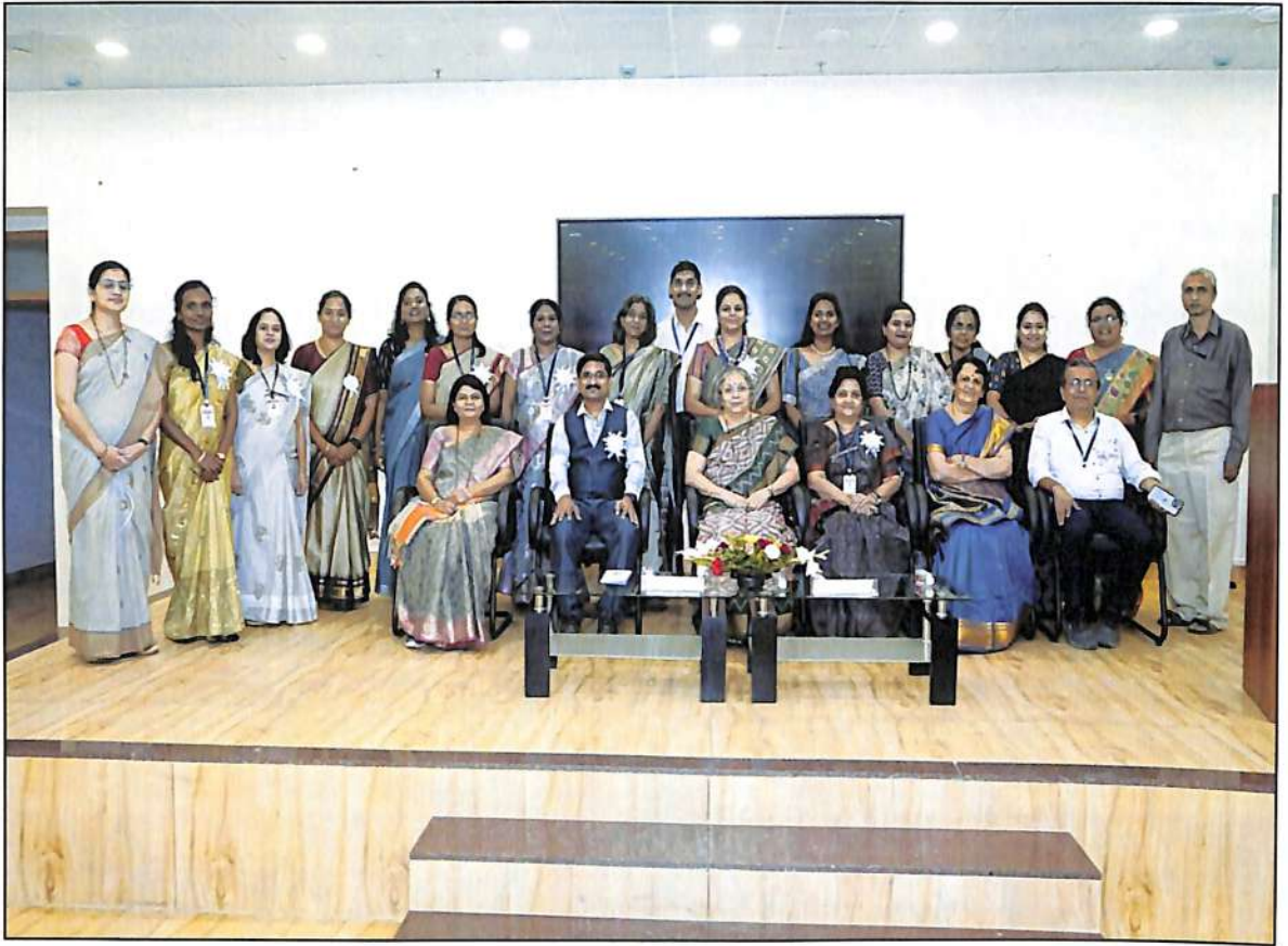
Members of the Organizing Committee of the Seminar