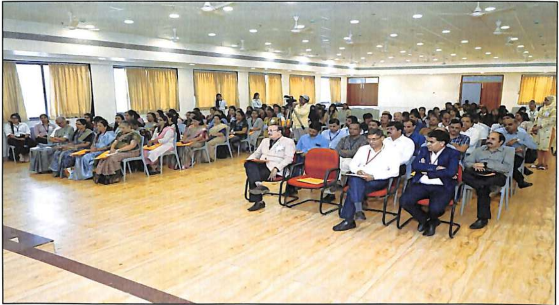
Dignitaries & Participants in the Seminar