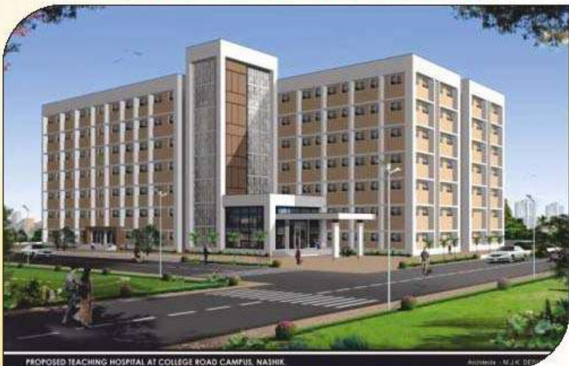
PROPOSED TEACHING HOSPITAL AT COLLEGE ROAD CAMPUS, NASHIK.